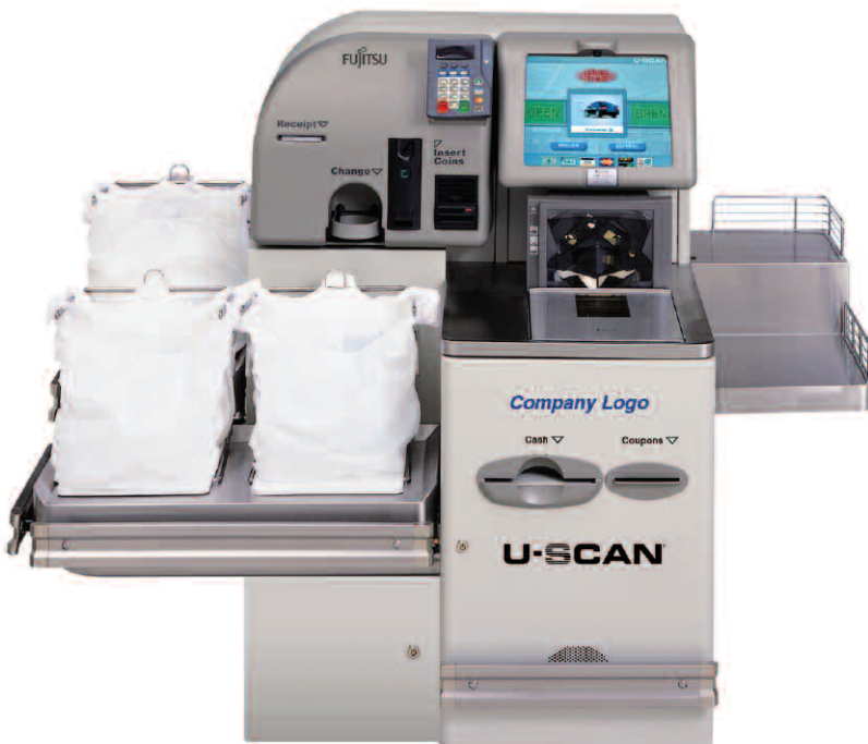
Designed for express checkout